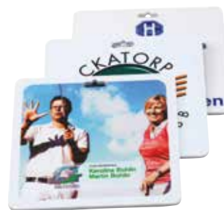
89 x 89 mm