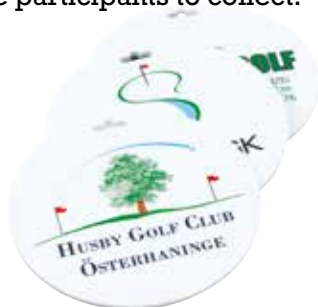
Ø 92 mm

With digital print you get great possibilities to create a personalised and varied print, even in smaller editions. Design your own bag tag for the annual corporate golf event, for the participants to collect.